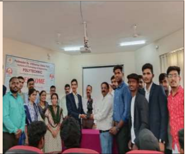
Farewell to Third year Electronics and Telecommunication students (2022-2023) by First year & Second year Mechatronics students.