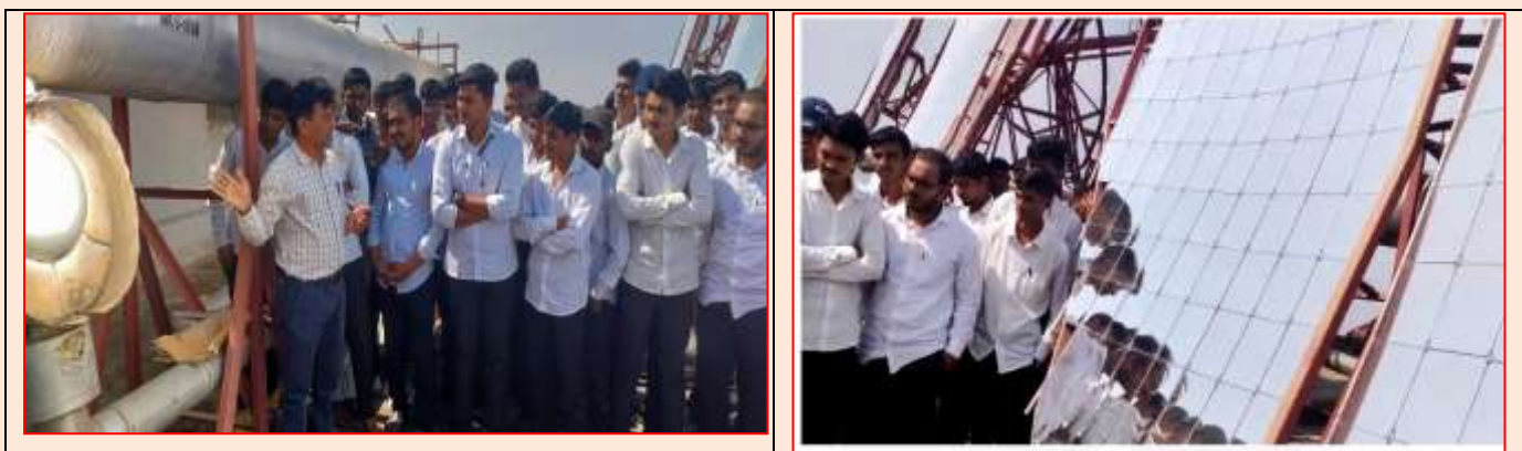
Second Year Mechatronics students Visited to Solar Cooking System, Shirdi, on 07/11/2022.