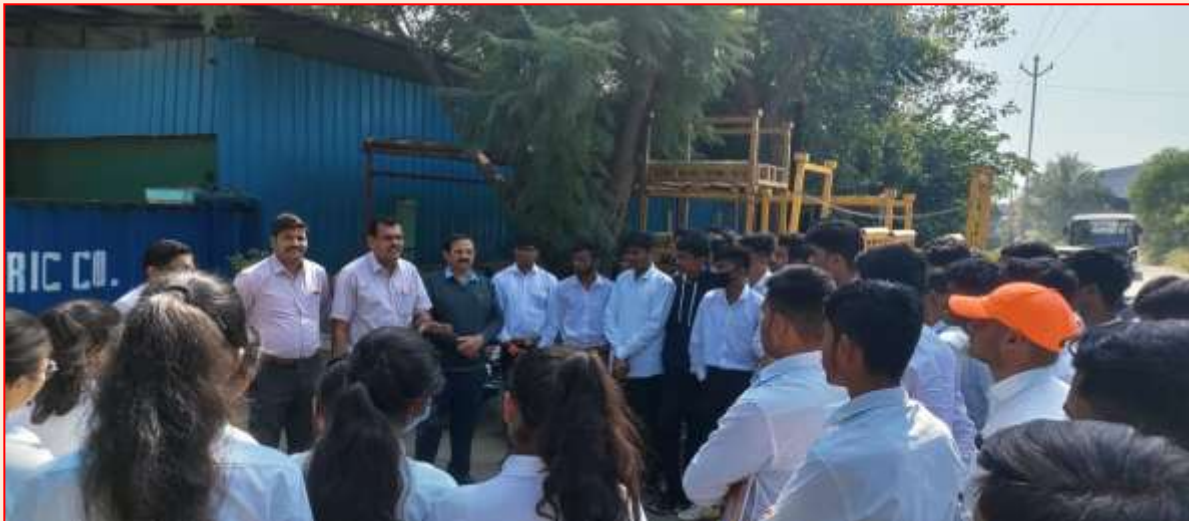
Second Year Mechatronics students Visited to Zen Electric, Ahmednagar, on 10/11/2022.