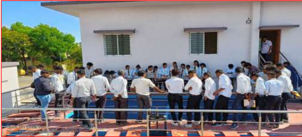
Second Year Mechatronics students Visited to Water Treatment Plant, Loni, on 30/03/2023.