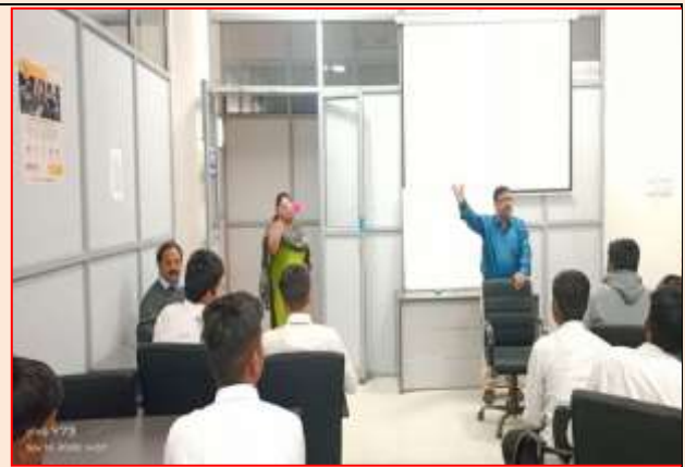
Second Year Mechatronics students Visited to Auto Cluster, Ahmednagar, on 10/11/2022.