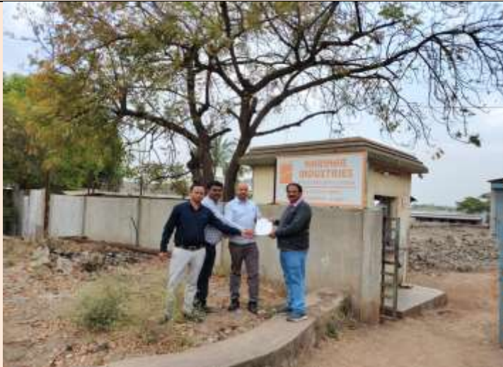
MOU was signed with Harihar Industries G-18 MIDC Ahmednagar, on 25/1/2023.