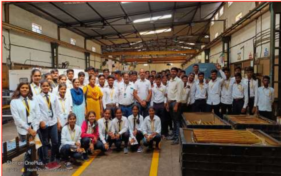
Second Year Mechatronics students Visited to Harihar Industries MIDC, Ahmednagar, on 21/2/2023.