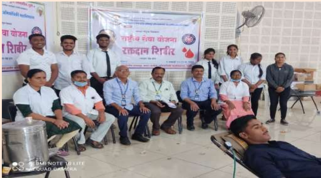
Blood Donation of Mechatronics student on 16/12/2022.