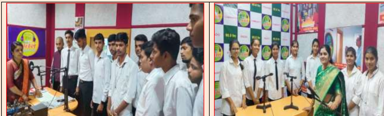
Second Year Mechatronics students Visited to FM 90.8 MHZ Station, Babhaleshwar, on 07/11/2023.