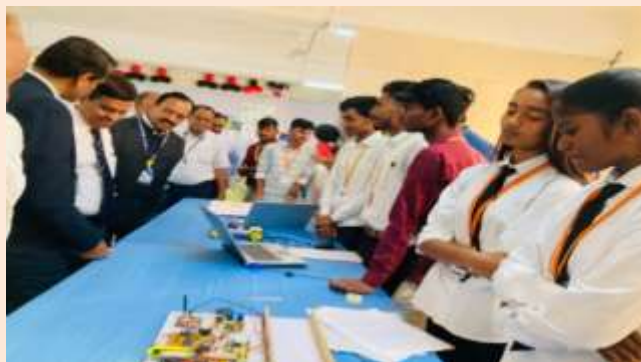
Second Year Mechatronics students participated in Project Competition organized by Mechanical Engineering Department ,Polytechnic Loni, on 3/3/2023.