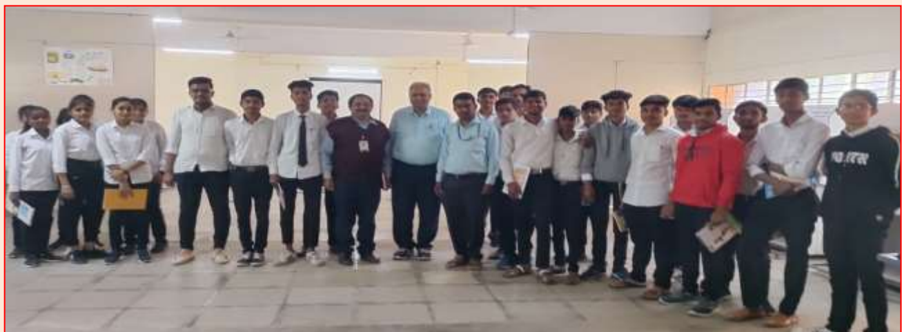
First & Second Year Mechatronics students Visited to Incubation Center & Tinkerers Lab Polytechnic, Loni, on 22/11/2022.