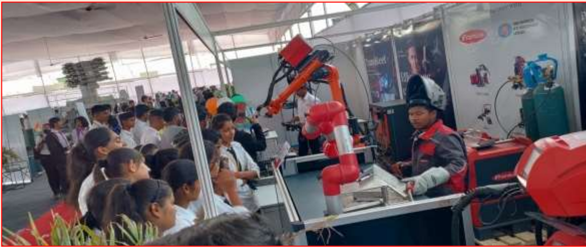
Second Year Mechatronics students Visited to Nibe Defence & Aerospace Pvt. Ltd, Nighoj, on 8/2/2023.