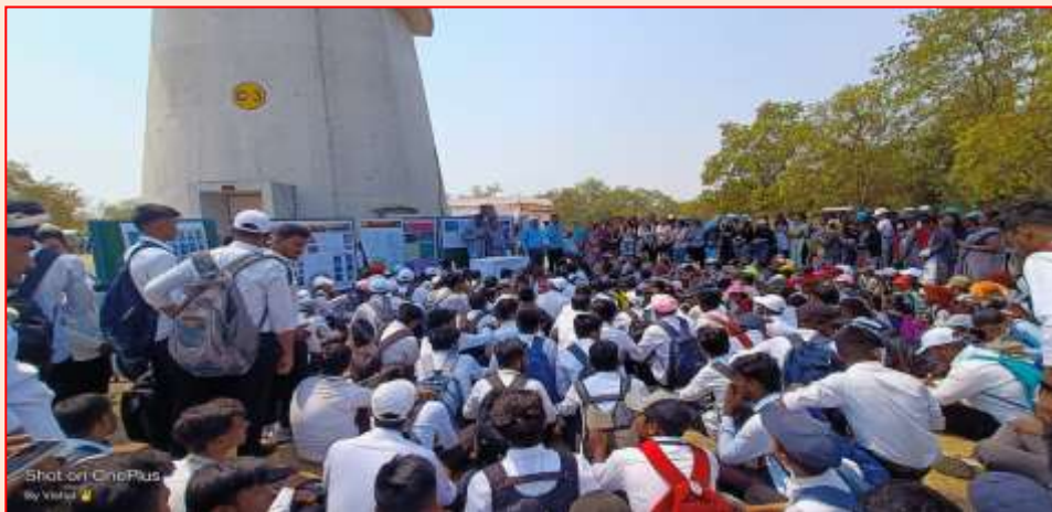
Second Year & First Year Mechatronics students Visited to GMRT Khodad, Pune, on 28/02/2023.