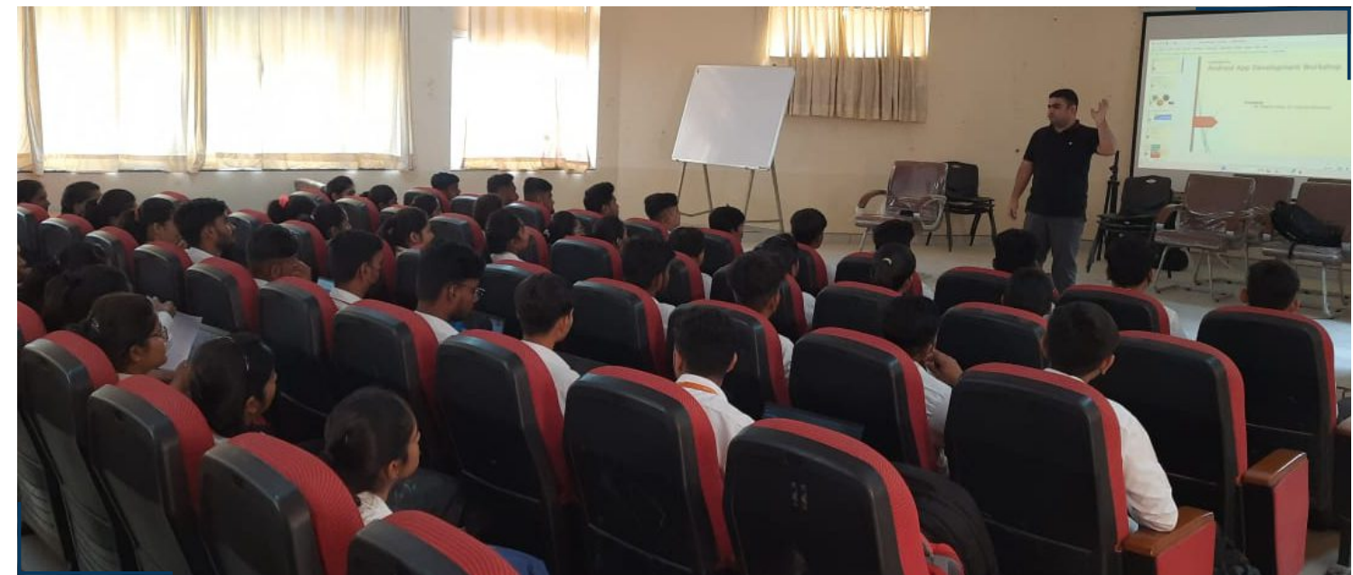
Workshop on "Android App Development" by Innovatus Technologies, Pune from 16/10/2023 to 18/10/2023