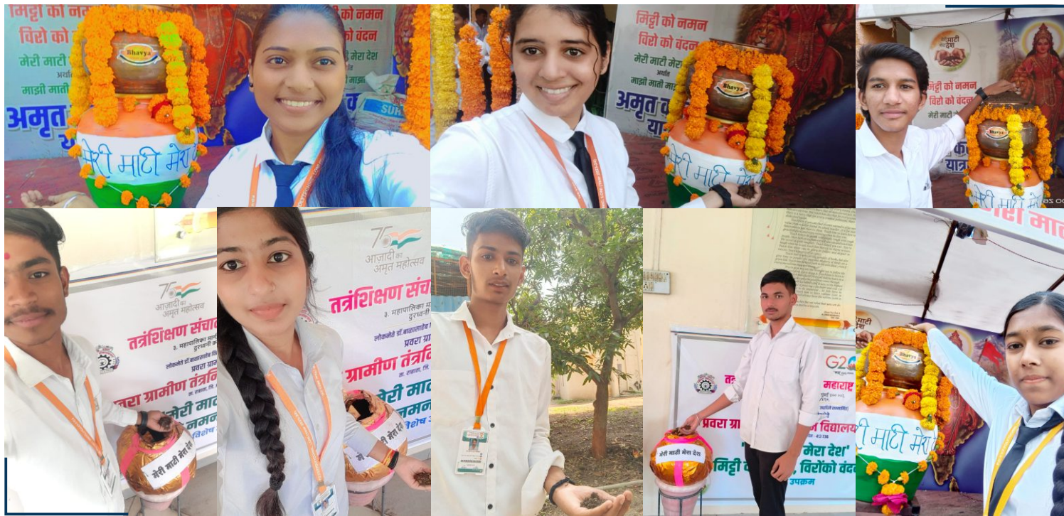
"Meri Mati Mera Desh" 05/10/2023