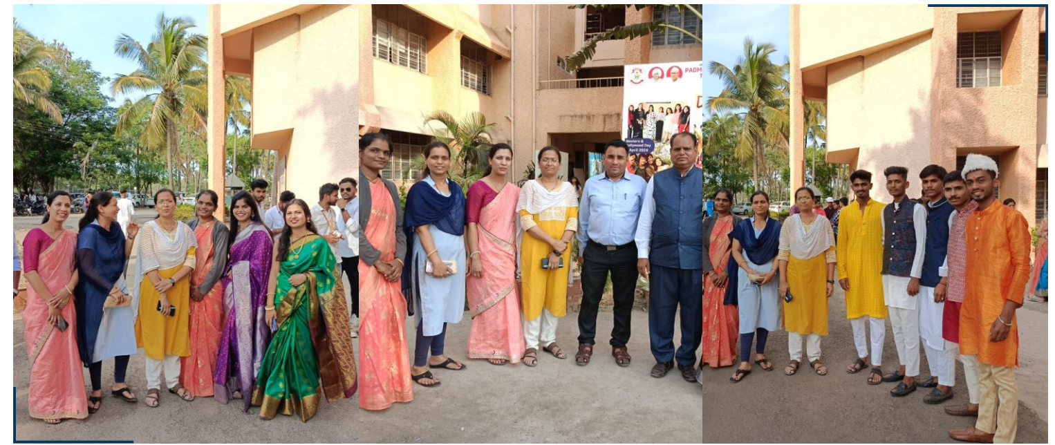
Cultural and Traditional Days in Annual Social Gathering Darpan 2024