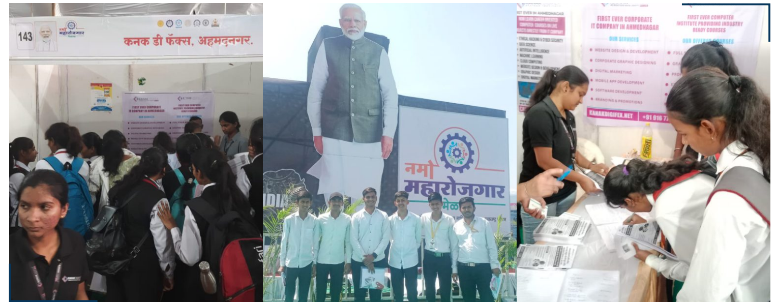
Students participated in Namoi MahaRojgar at Ahmednagar on 28 and 29/02/2024