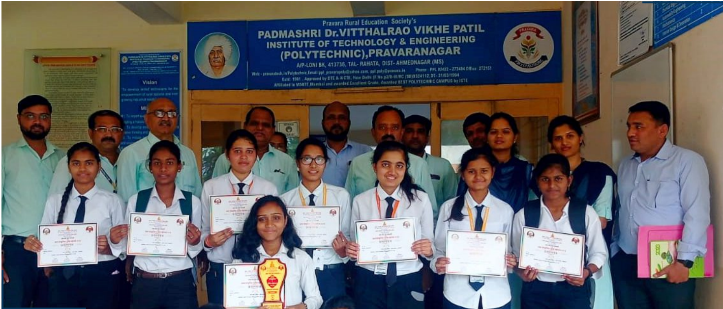
Students Won Prizes in Cultural Events held in "EK GAAV EK GANPATI 2023"

Keeping in view this advancement of cloud computing and big data, our institute took a step ahead of other institutes and decided to provide this opportunity to rural students and started the first branch of "Cloud Computing and Big Data" in 2021-22. The main objective of launching this course is to give exposure to students from rural areas and give them mastery in the field of cloud technology and big data.