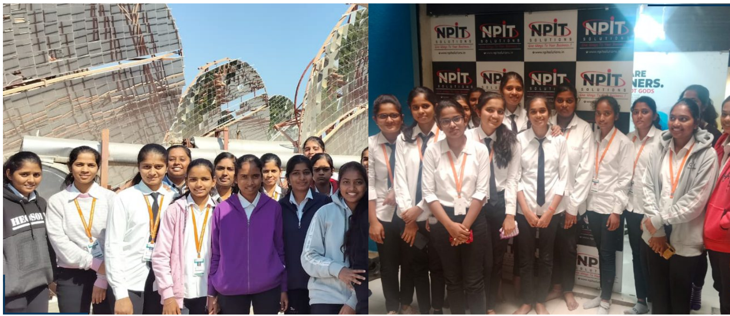
Industrial Visit to "Solar System" at Shirdi and NPIT Nashik on 24/01/2024 and 10/02/2024 respectively