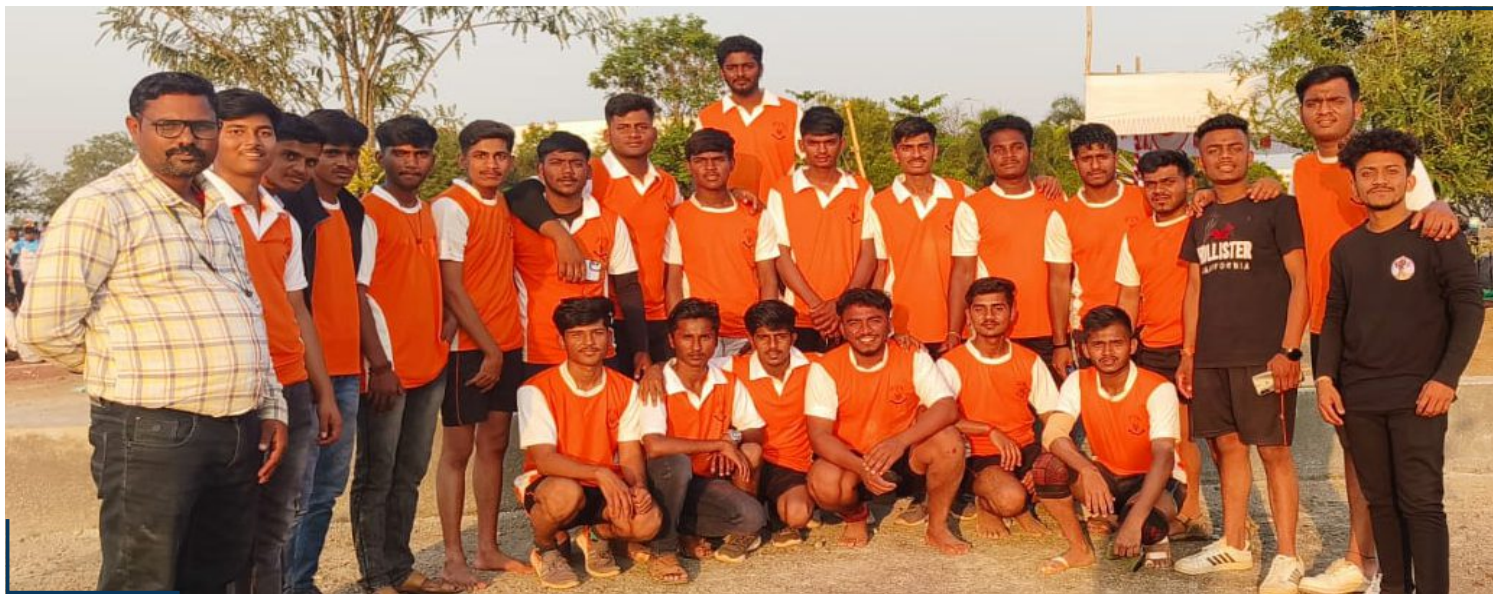
Students participated in Kabaddi Event under IEDSSA Sports at Ahmednagar on 02/02/2024