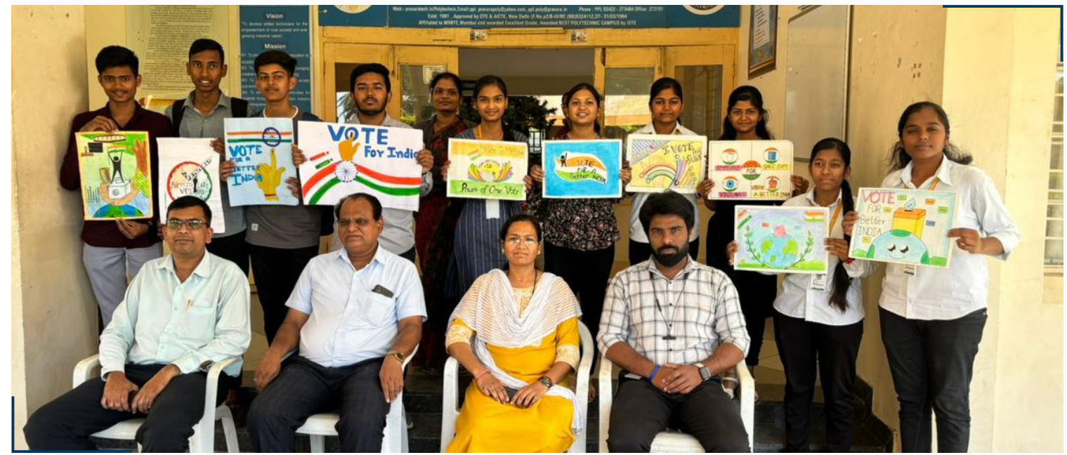
Social Activity: "Poster Exhibition on "Nothing Like Voting, I Vote for Sure" on 06/03/2024