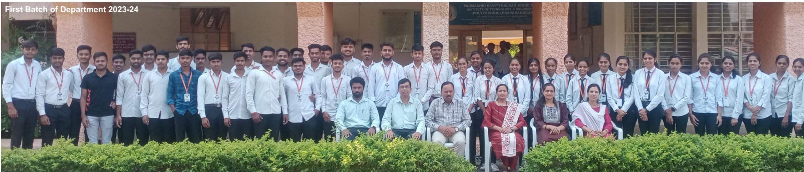
First Batch of Department 2023-24