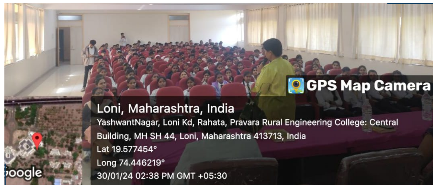
Entrepreneurship Program on "How to become an Entrepreneur" on 30/01/2024