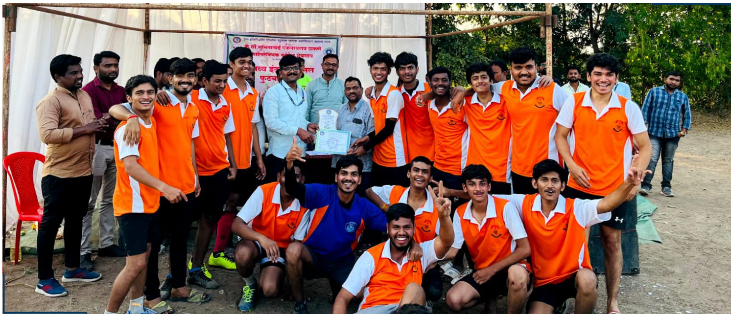
Winner in Football IEDSSA Men's E1 Zonal Sports Meet at Dhakane Polytechnic Shevgaon held in 2023-24