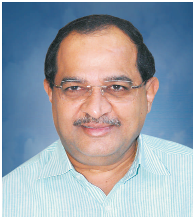
Hon'ble Namdar Dr. Radhkrishna Vikhe Patil

Chairman, Loknete Dr. Balasaheb Vikhe Patil (Padma Bhushan Awardee) Pravara Rural Education Society, Pravaranagar