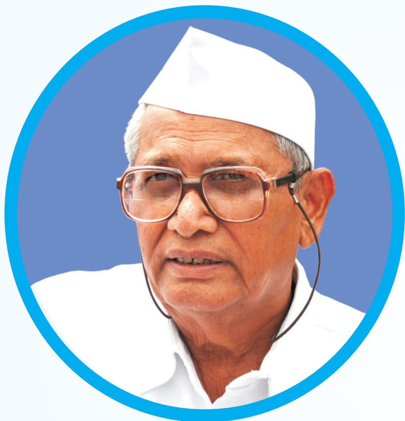
Dr. Balasaheb Vikhe Patil