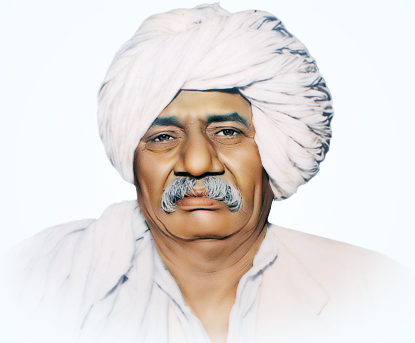
Dr. Vitthalrao Vikhe Patil