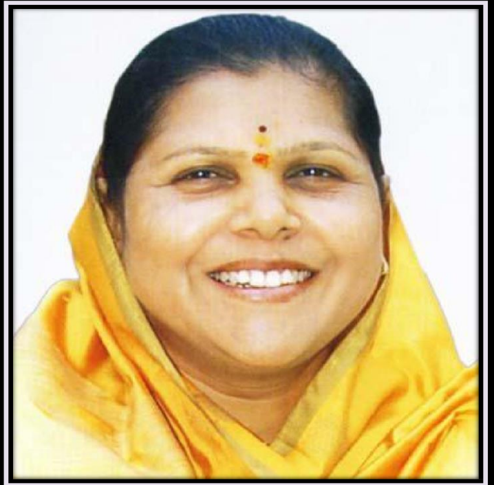
Hon. Namdar Sau. Shalinitai Vikhe Patil Ex-President of Z.P Ahmednagar