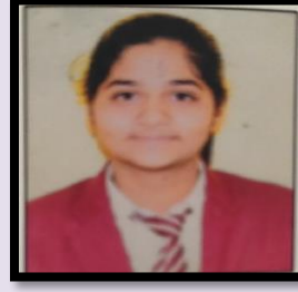
Ithape Sakshi PCB – 93.00%