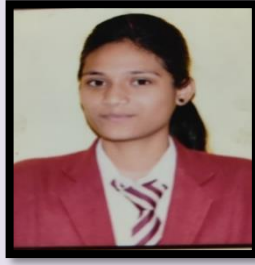
Second Rank-Turakane Siddhi M 91.00 %