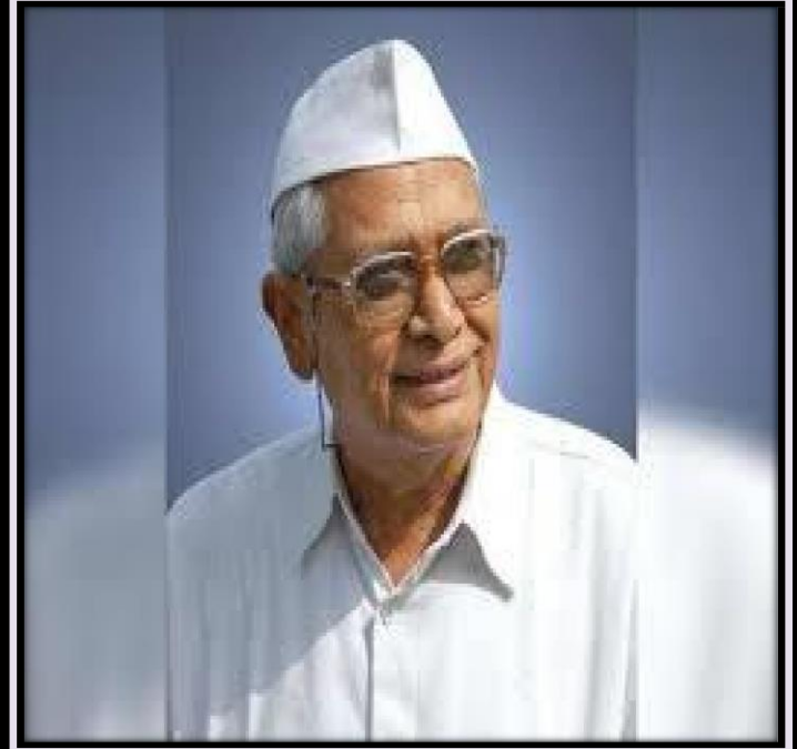
Loknete Dr. Balasaheb Vikhe Patil (Padma bhushan Awardee) (1932-2016)