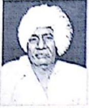
Padmashri Dr. Vikhe Patil (1921-1982)