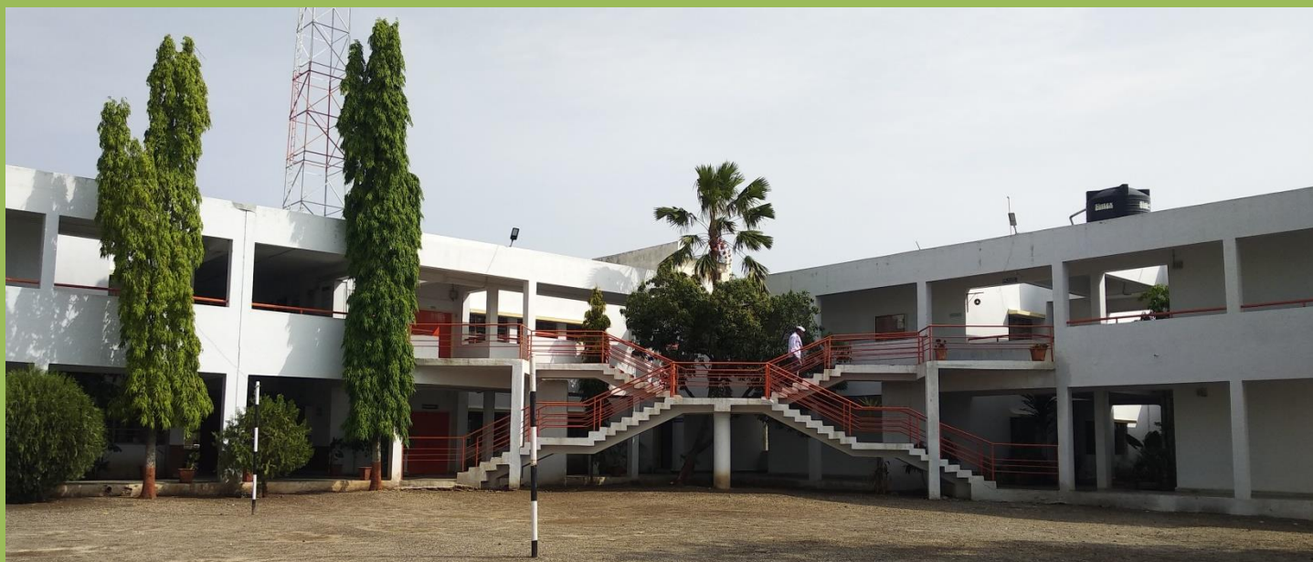
Pravara Rural College of Pharmacy (Diploma)