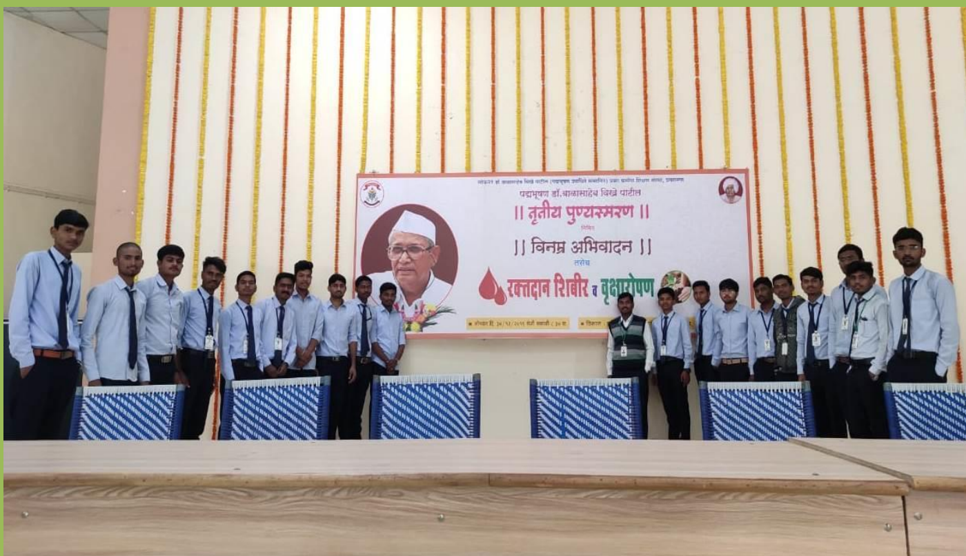
A blood donation camp and tree plantation was organized on the occasion of 3 rd Death Anniversary of Padmabhushan Dr.Balasaheb Vikhe Patil at PREC, Loni