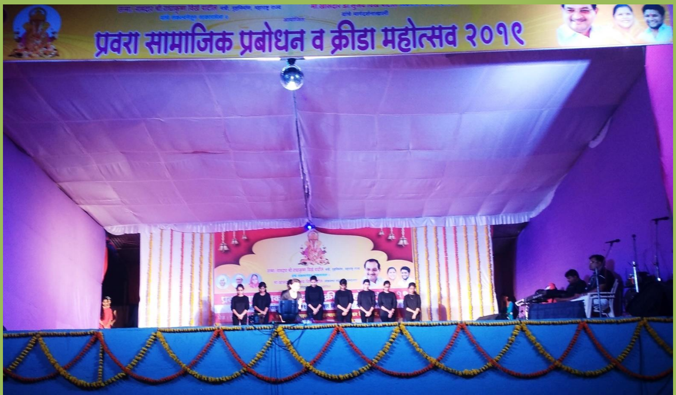
Performance of our institute students on social theme in “Pravara social & sports Festival-2019”