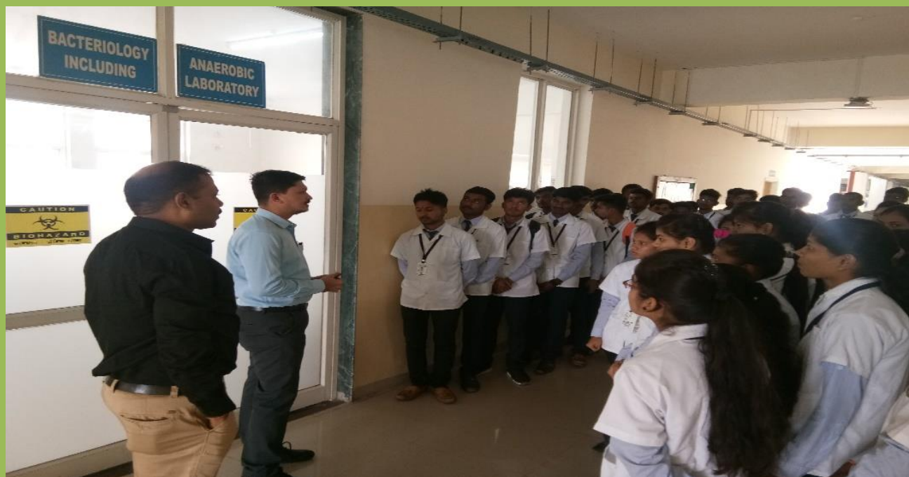
Students interacting with Pravara Rural Hospital staff of various departments.