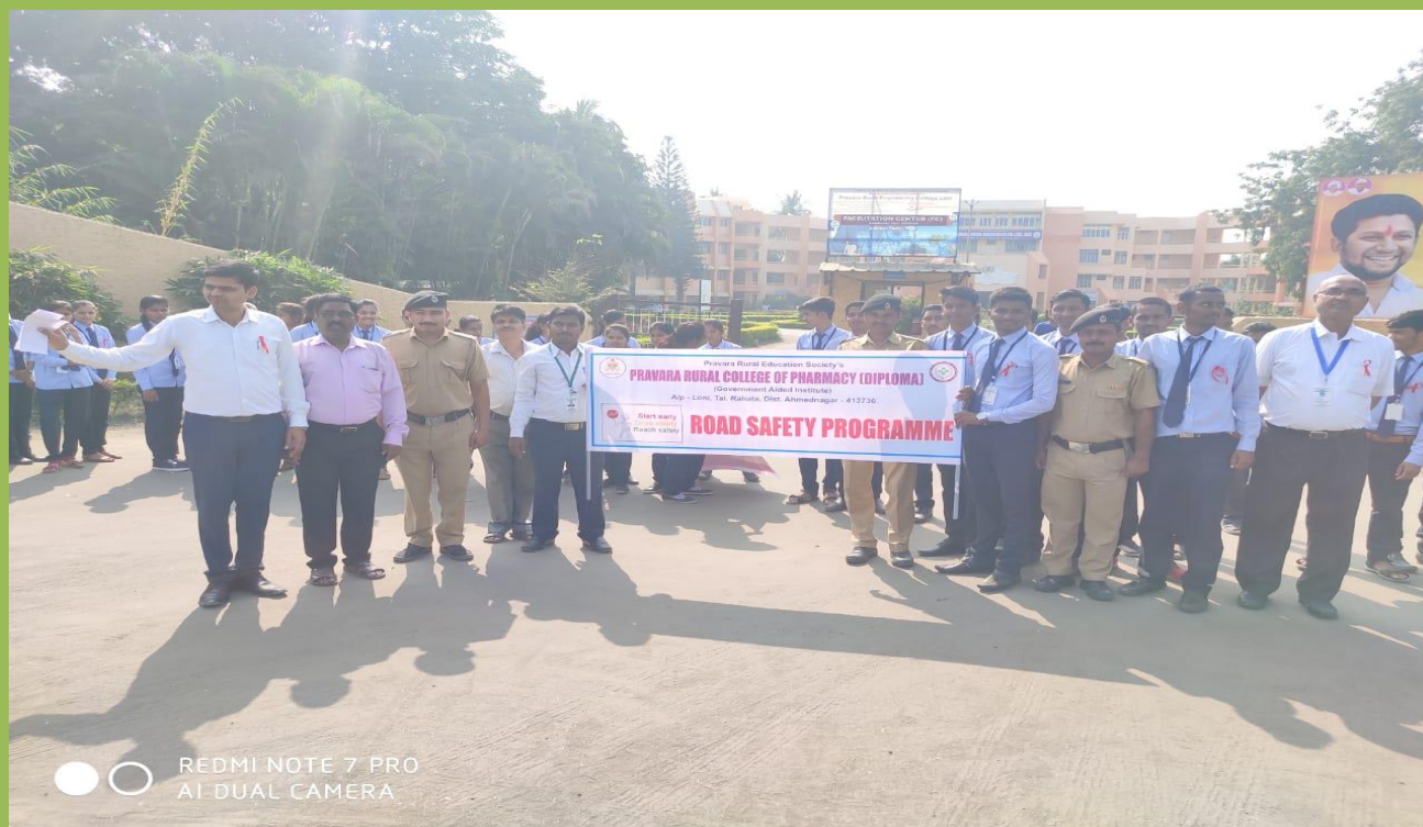
Participation of the students and faculty's in road safety awareness Programme