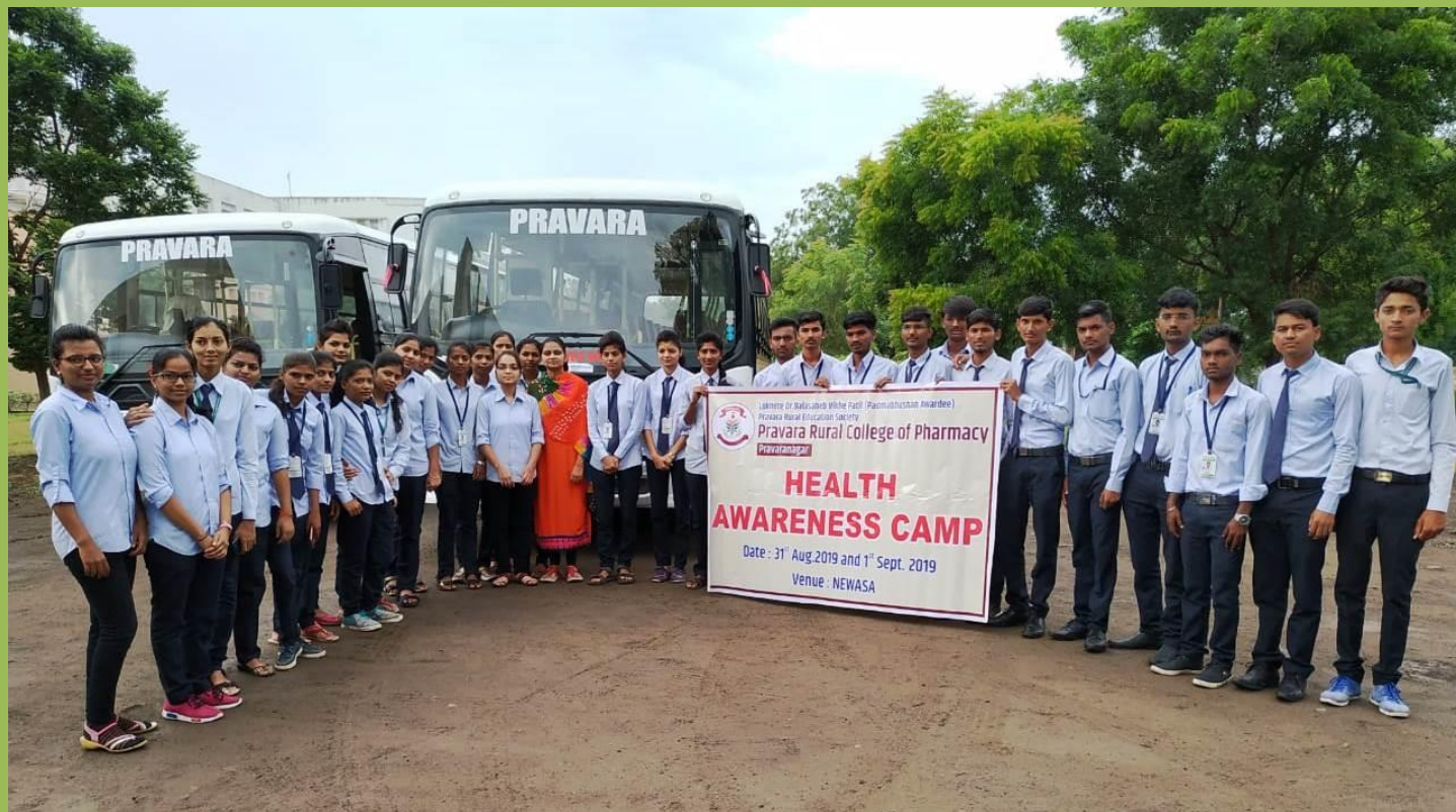
Participation of the students in Health Awareness Camp organized at Newasa.