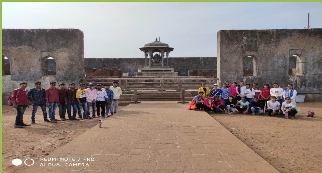
Academic Tour at Raigad fort which is situated in Mahad, Raigad district of Maharashtra

19 th December 2019 to 22 nd December 2019