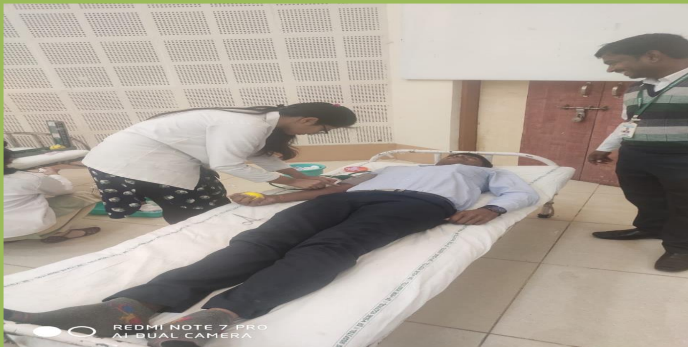
Participation of students and faculty in the blood donation camp