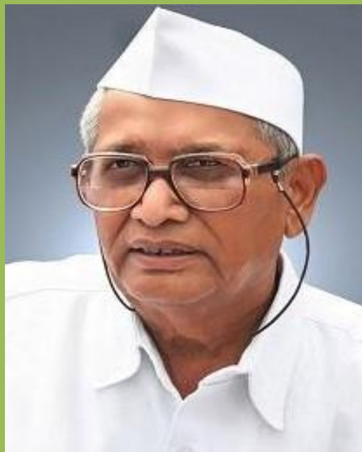
Late Dr. Balasaheb Vikhe Patil (Padmanhushan Awardee) (1932-2016)