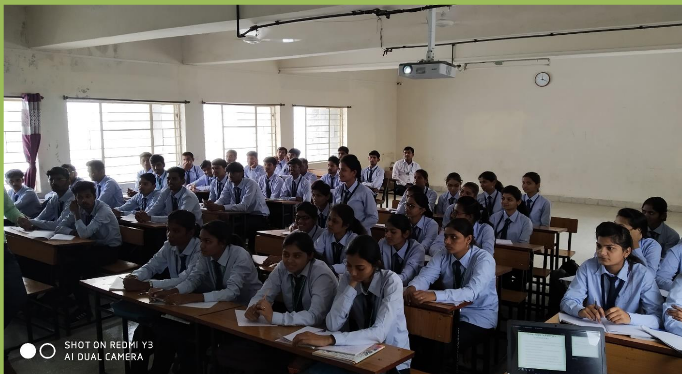
Second year students attending the guest lecture on "Parental Formulations"