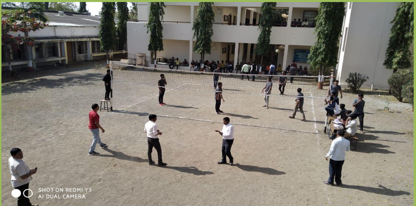
Volleyball Match during Annual Sport Events-2K20.