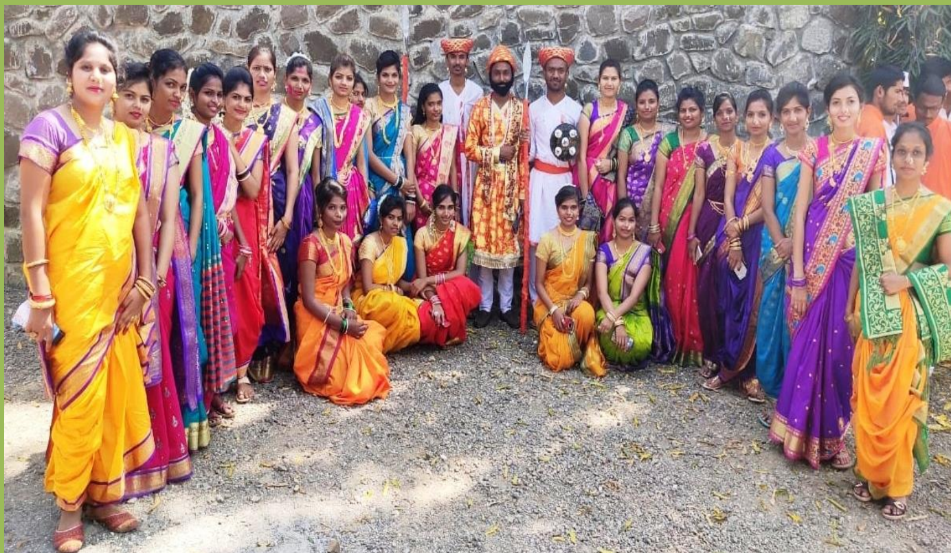
Traditional Day of 'PHARMAFEST-2K20' celebrated by the students.