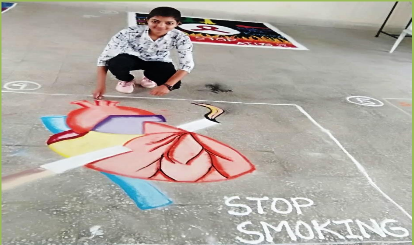
'Stop-Smoking' a social message through rangoli competition by the students.