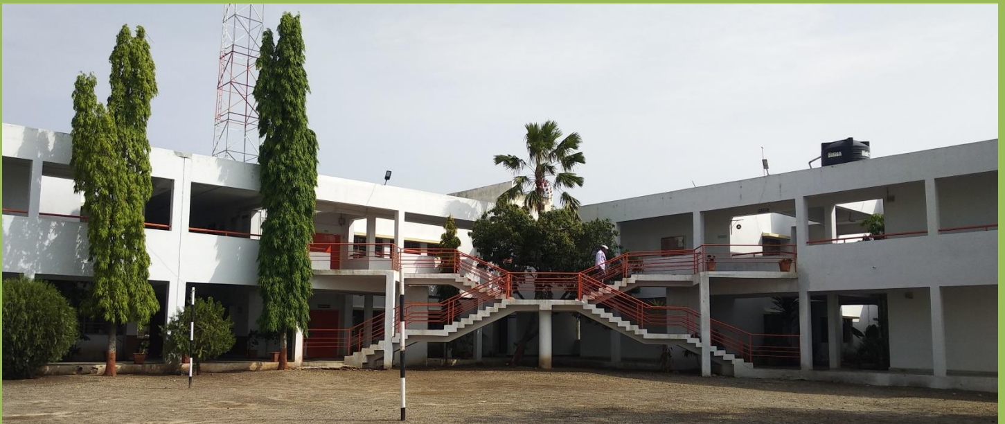
Pravara Rural College of Pharmacy (Diploma)