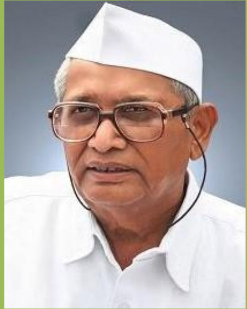
Late Dr. Balasaheb Vikhe Patil (Padmanushan Awardee)(1932-2016)