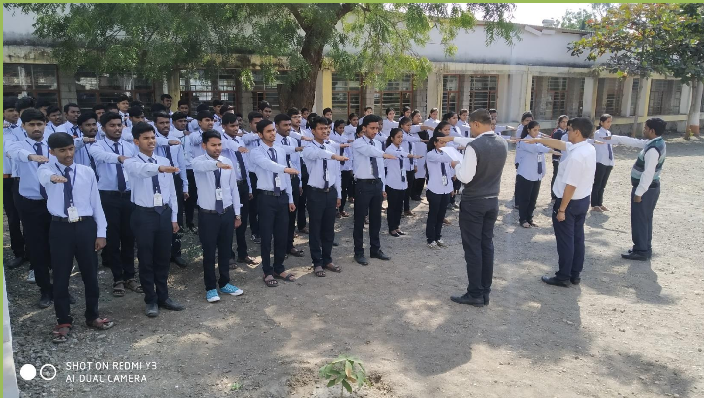
The AICTE initiative Swachhata Pakhwada is observed in the institute.