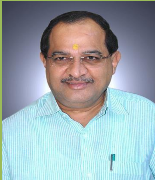
Hon. Shri. Radhakrishna Vikhe Patil Chairman, Loknete Dr. Balasaheb Vikhe Patil (Padmabhushan Awardee) Pravara Rural Education Society, Pravaranagar Ex. Minister of Housing, Govt. of Maharashtra