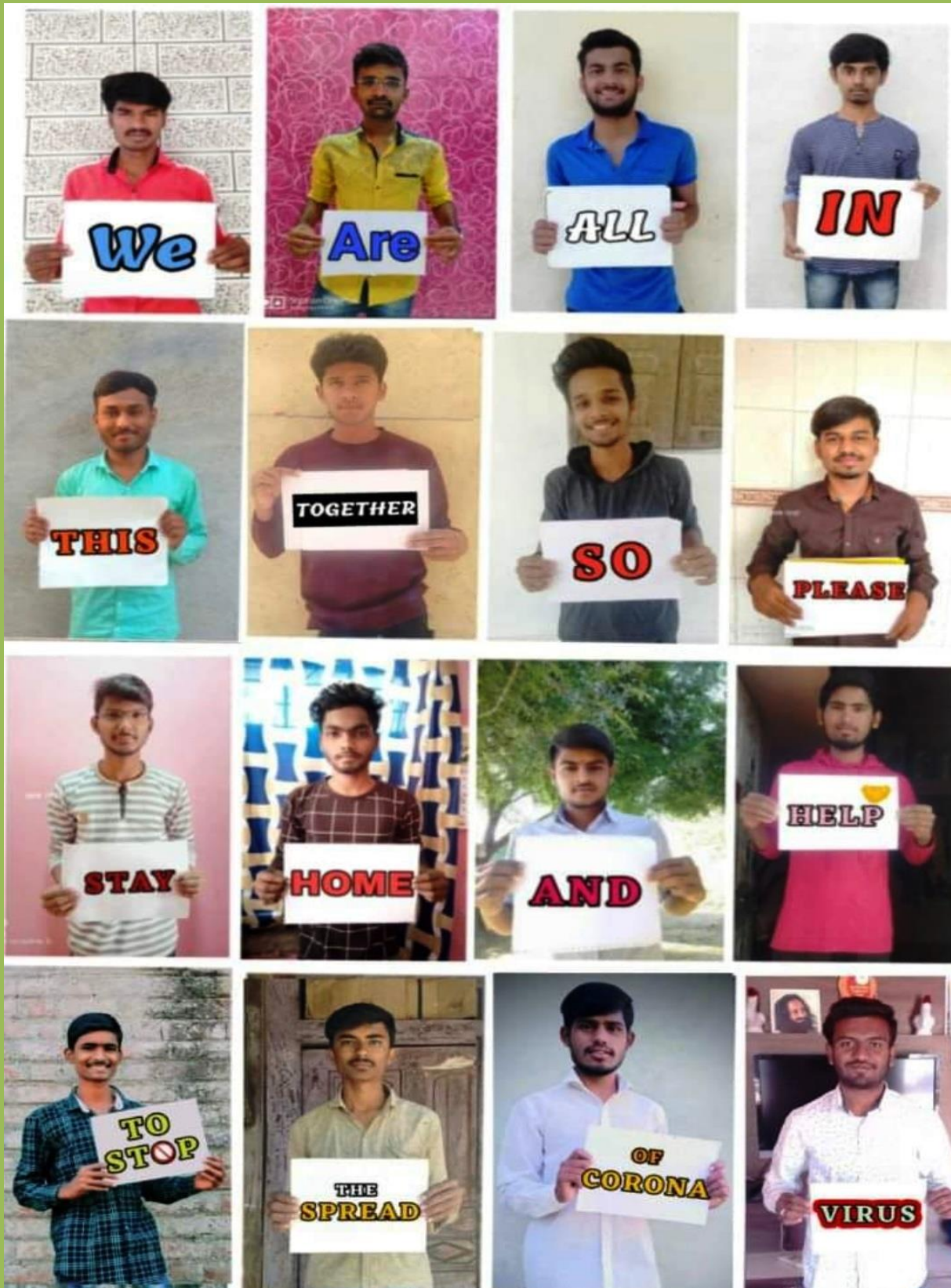
STAY HOME-STAY SAFE message by the students in COVID-19 online awareness programme.