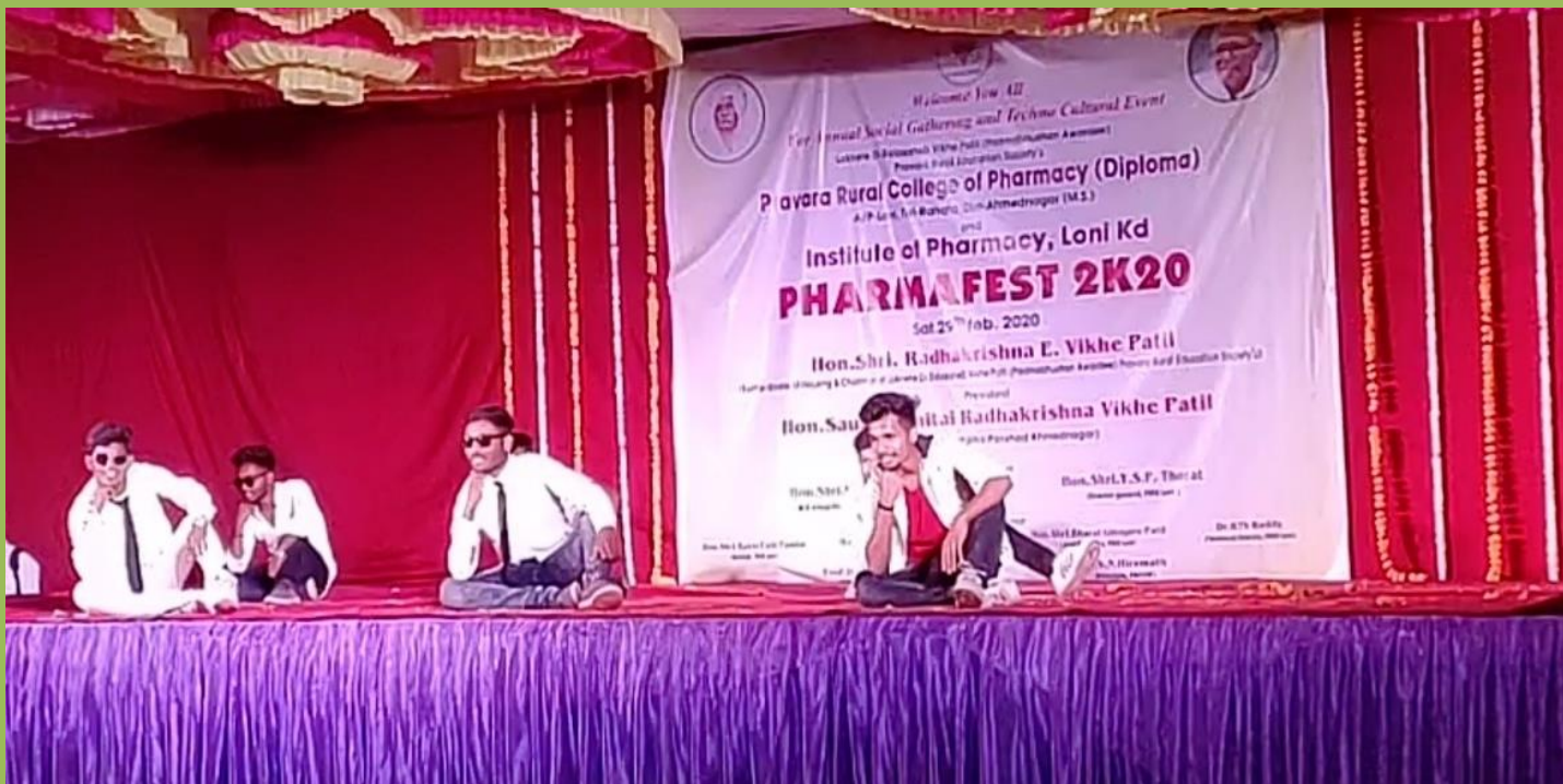
Participation of the students in Cultural events of 'PHARMAFEST-2K20'.