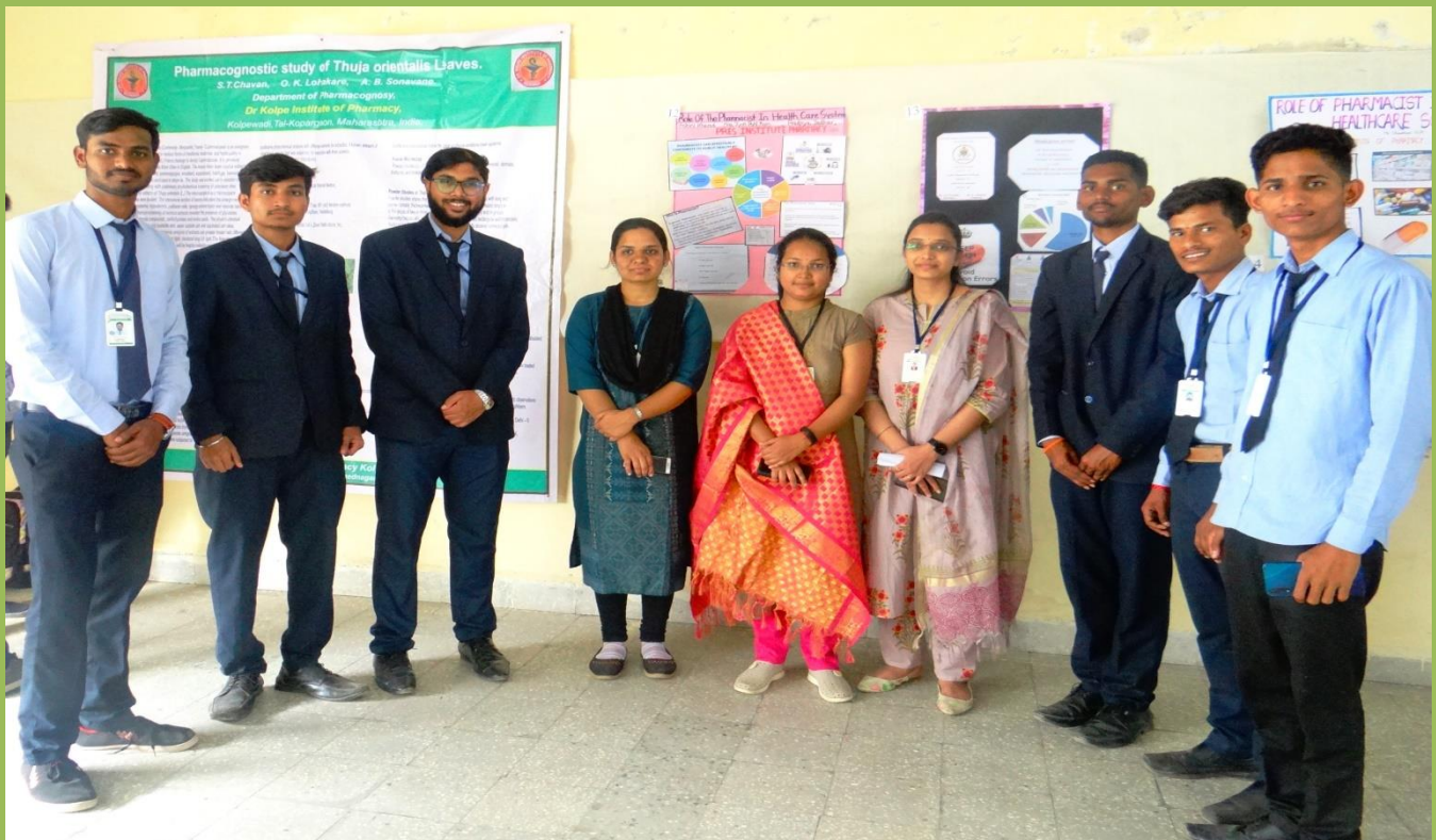
Participation of the students and faculty delegates in State Level Poster Presentation Competition.