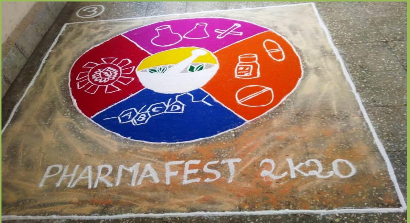
Rangoli competition organized by the Institute on the occasion of 'PHARMAFEST-2K20'.