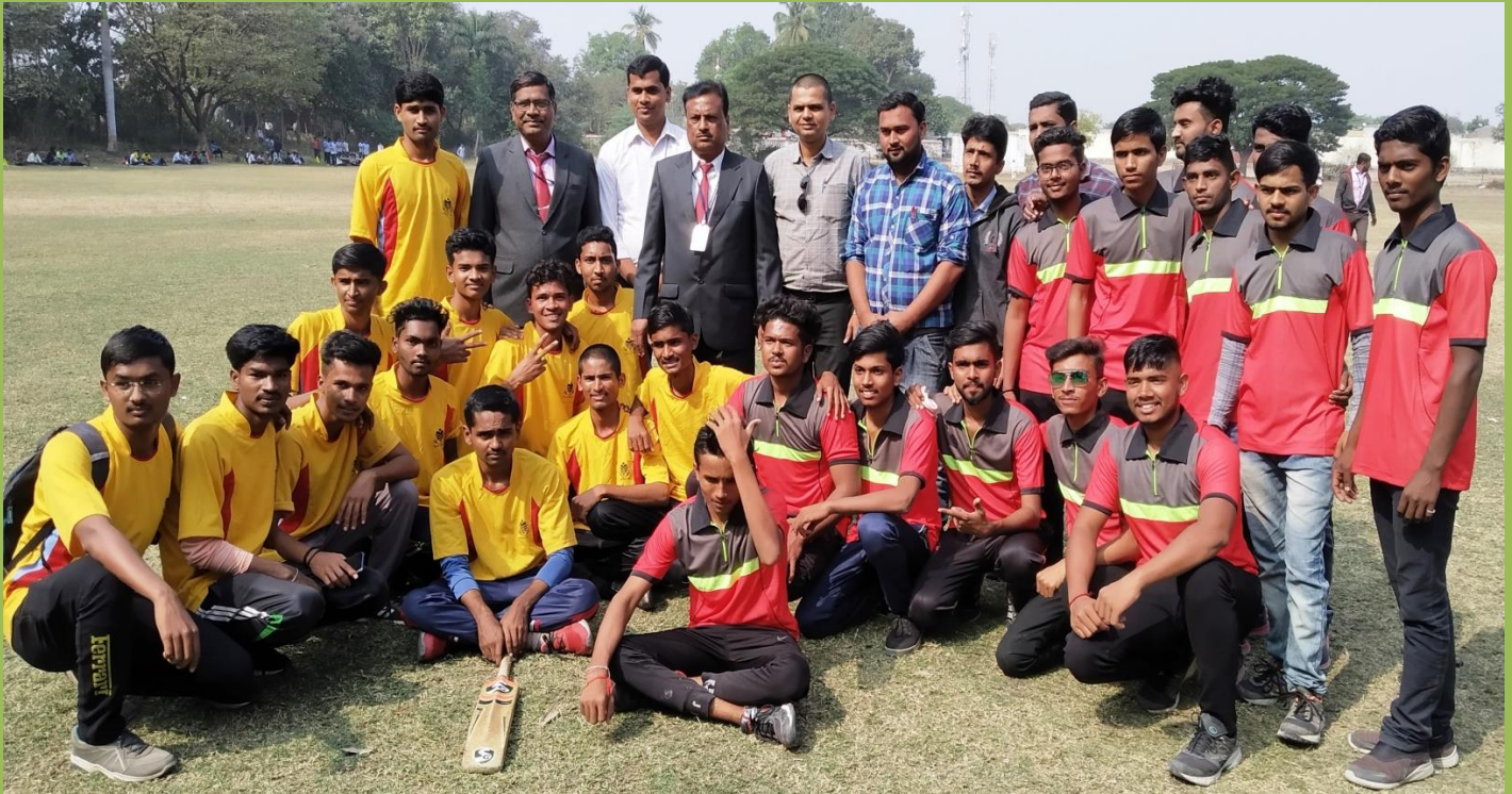
Participation of Institutes Cricket Team in IEDSSA Sports